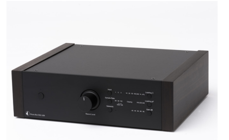
black with eucalypthus wood side panels