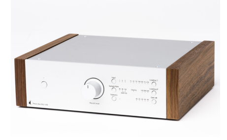
silver with walnut wood side panels