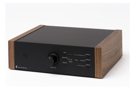
black with walnut wood side panels