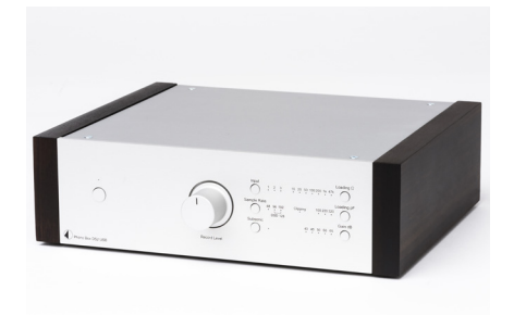
silver with eucalypthus wood side panels