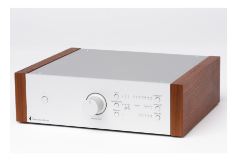
silver with rosewood side panels